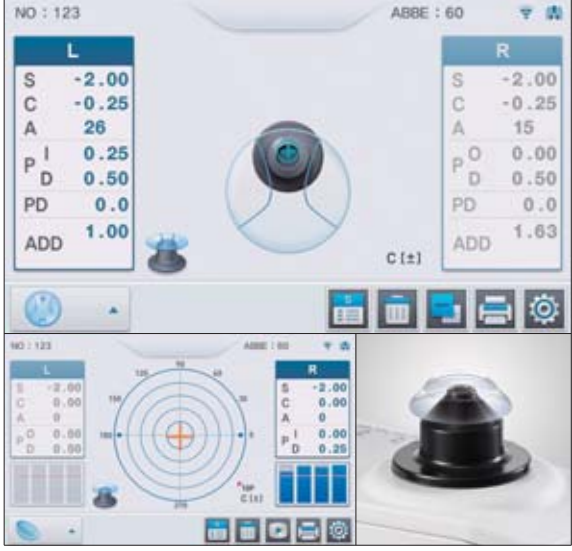
Contact Lens Measurement