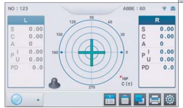
Intuitive Prism Direction

Classic communication via RS-232 cable is available for data transmission with previous models.