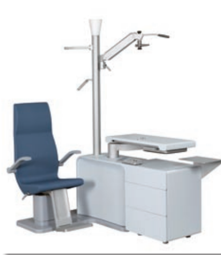
Light Blue unit with blue patient chair