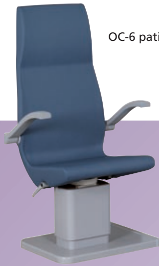
OC-6 patient chair

VT-670 phoropter arm VT-670 phoropter arm enables mounting of most available phoropter heads. The mechanical lock ensures fixed positioning of the phoropter in front of the patient.