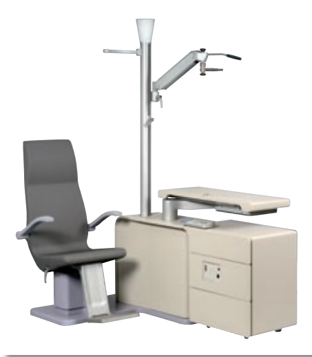
White unit with gray patient chair

IS-600II comes in 2 different colours which both match perfectly with instrument colours. Metal parts of IS-600II ophthalmic unit are painted in aluminium colour, emphasising the modern and smooth design of the unit.