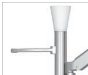
The dimmable uplighter illuminates the room indirectly