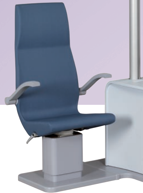
IS-600II basic unit with blue OC-6