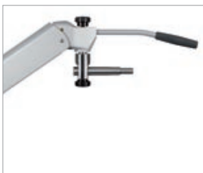
VT-671 slim design phoropter arm with handle for easy manoeuvring.