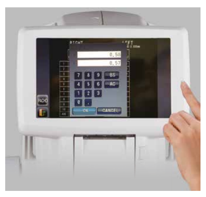
* Adjusted Tono value is reference value

The CT-800 is able to calculate Adjusted Tono value from measured IOP to manually input the corneal thickness value measured by other devices such as a pachymeter.